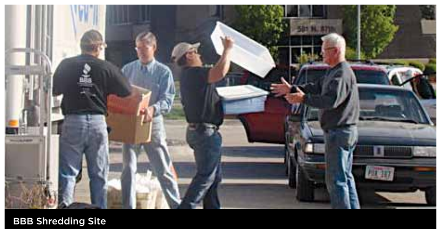
BBB Shredding Site

BBB thanks its generous partners for helping make this event such a huge success!