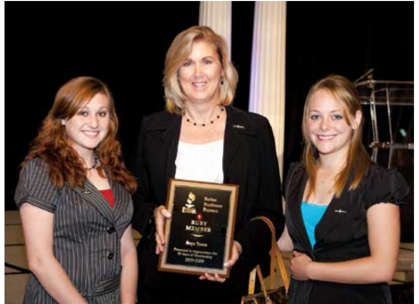
Boys Town, 70 Year Ruby Member