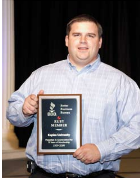
Kaplan University, 70 Year Ruby Member